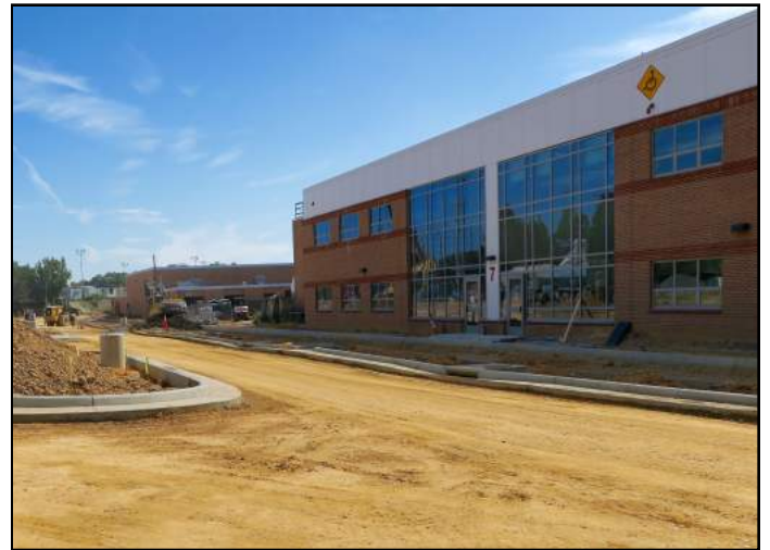
See our website, tjpartnership.org , for the latest renovation photos.

Parents, who have only recently learned to enter the school through its grand Jeffersonian dome, will soon be adjusting to a new campus traffic pattern as the kiss-and-ride area moves to its final location behind the school (right). Additional exterior work completed this summer includes the removal of the back "learning cottages," extensive road work, and the construction of a new stadium press box and concession stand.