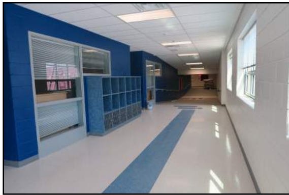
Above, a Humanities hallway. Below, a Physics classroom.