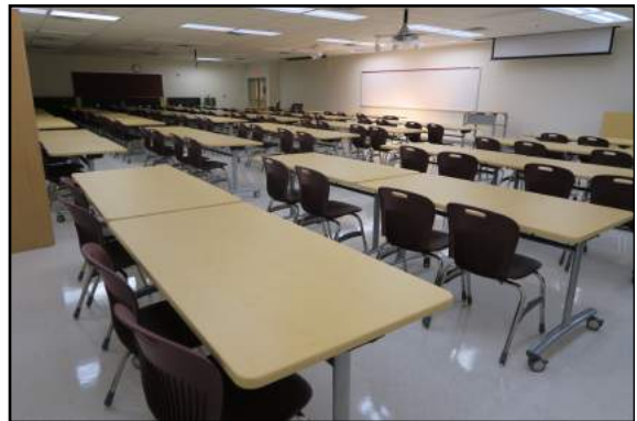
The Lecture Hall (above) will be used this fall for team-taught classes. Below, a Design & Tech classroom.